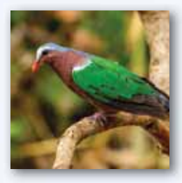
State Bird Emerald Dove (Chalcophaps indica)

• 1049 BMCs constituted at Block, Village Panchayats and Urban Bodies