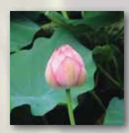
State Flower Lotus (Nelumbo nucifera)