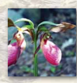
State Flower Lady Slipper Orchid (Paphiopedilum insigne)