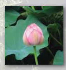
State Flower Lotus (Nelumbo nucifera)