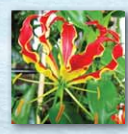
State Flower Kandhal (Gloriosa superba)