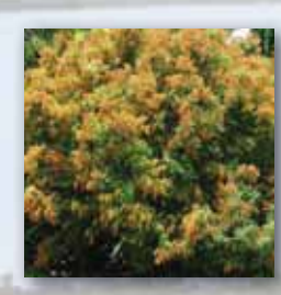
State Tree Iron Wood (Mesua ferrea)