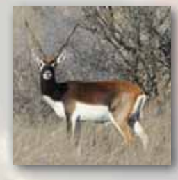
State Animal Black Buck (Antilope cervicapra)