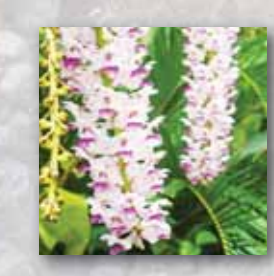
State Flower Foxtail orchid (Rhynchostylis retusa)