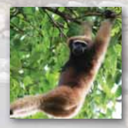
State Animal Hoolock Gibbon (Bunopithecus hoolock)

• 77 PBRs prepared so far at village Panchayats