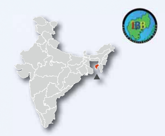
State Bird Green imperial pigeon (Ducula aenea)

Year of Establishment: 16 June 2008 Promulgation of State Rules: 29 November 2008