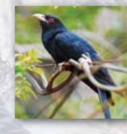
State Bird Koel (Eudynamys scolopacea)

Year of Establishment: 20 December 2002 Promulgation of State Rules: 1 April 2007