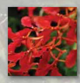
State Flower Red Vanda / Senhri (Renanthera imschootiana)