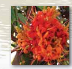
State Flower Asoka (Saraca asoka)