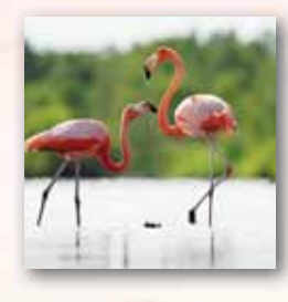
State Bird Greater Flamingo (Phoenicopterus rubber)

• 1342 PBRs prepared at Block and Village Panchayats