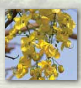
State Flower Golden shower (Cassia fistula)