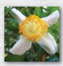
State Flower Nageshwar (Mesua ferrea)