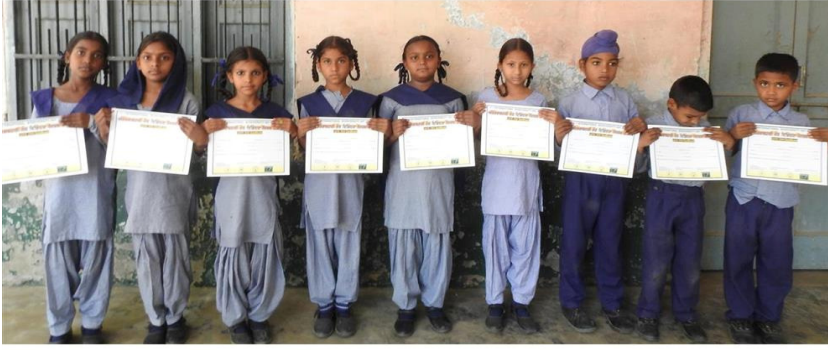
WINNERS OF SIT AND DRAW COMPETITIONS