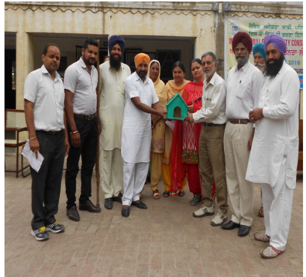
IBD celebrations at District Sangrur