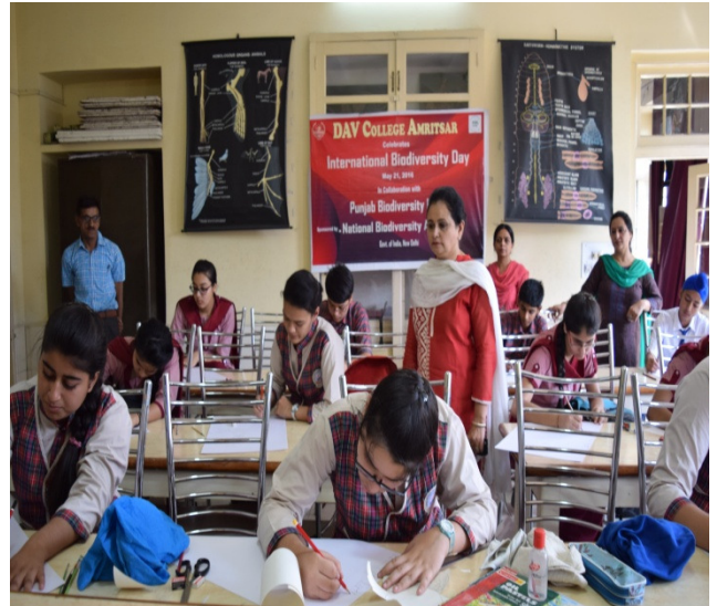
IBD celebrations at DAV College, Amritsar