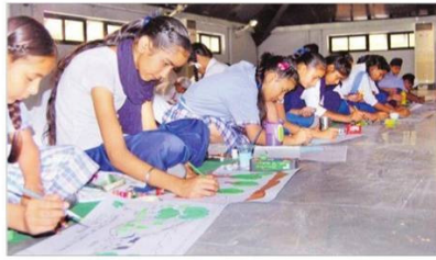
Students take part in a painting competition held as part of biodiversity day celebrations at Science City in Kapurthala on Saturday.