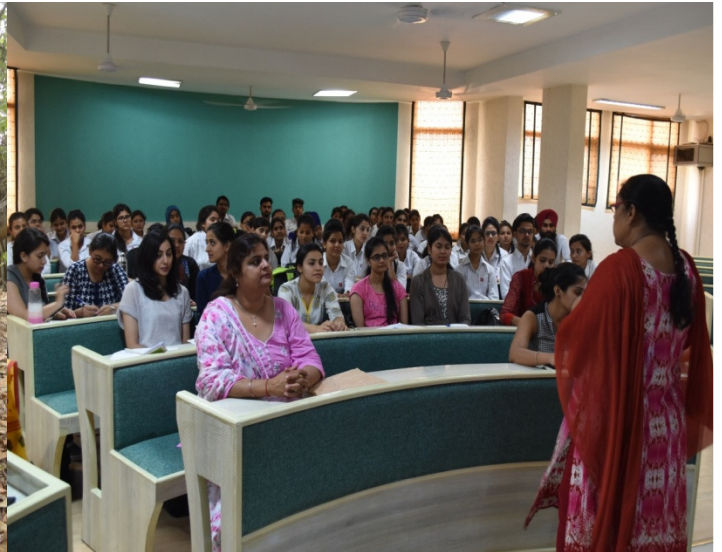
IBD celebrations at District Patiala