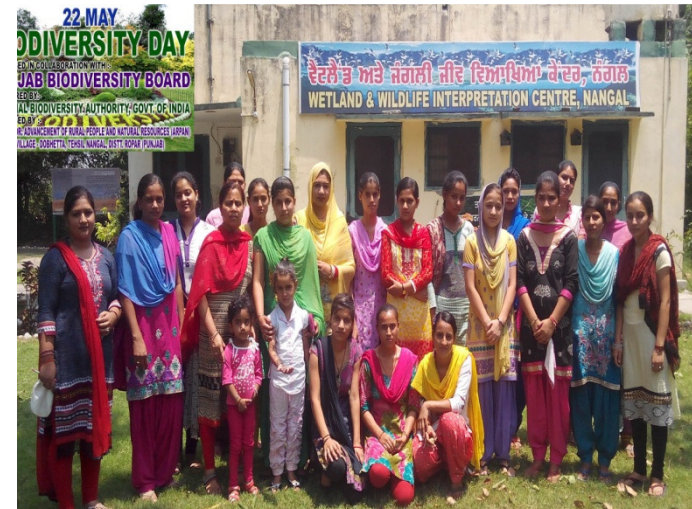
IBD celebration at District Roopnagar