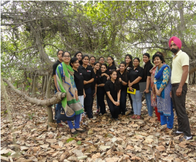
IBD celebrations at District Faridkot