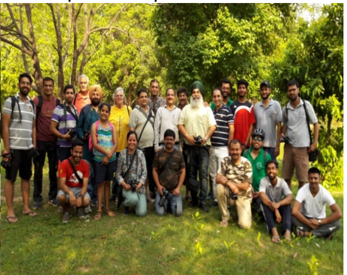
IBD celebrations at Panjab University, Chandigarh