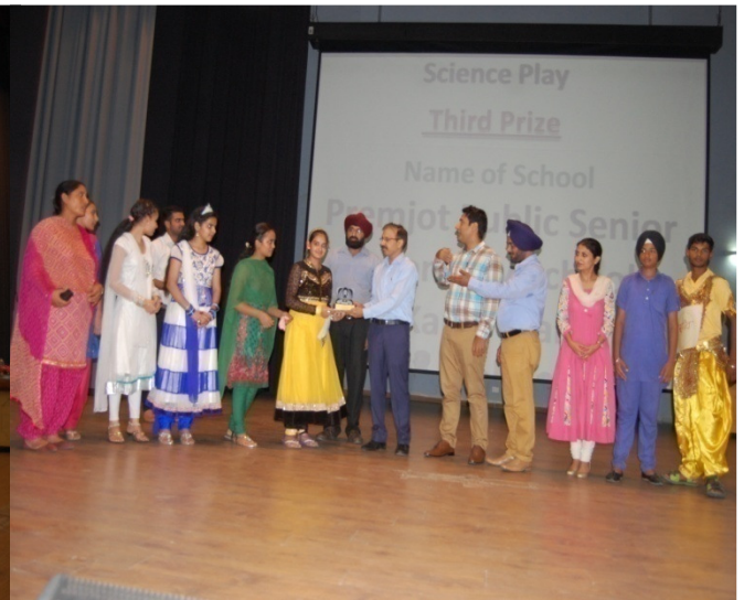
IBD celebrations at Pushpa Gujral Science City, Kapurthala