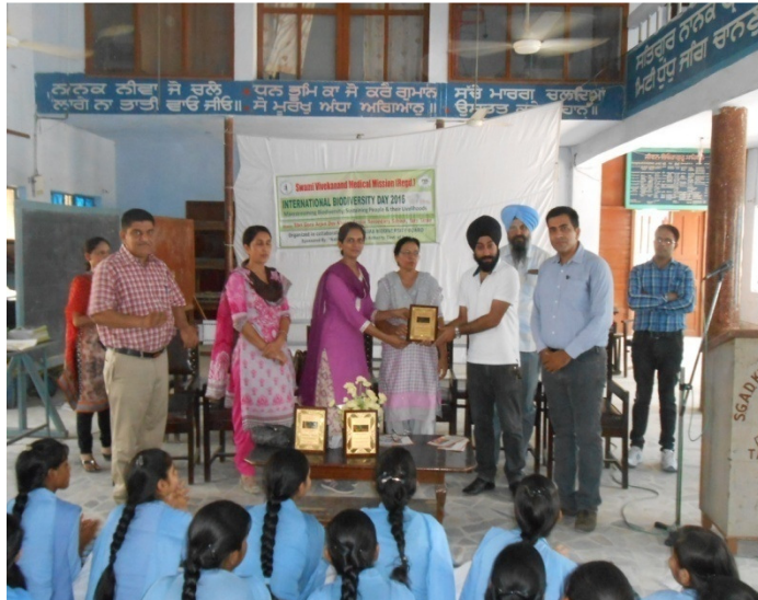
IBD celebrations at District Tarn Taran